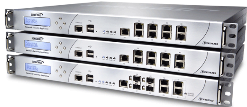
NSA E-Class Series