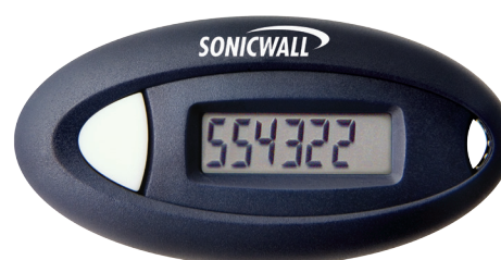
DIGIPASS BY VASCO