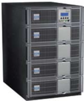
Eaton MX Frame