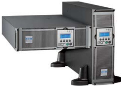
Eaton MX versatility