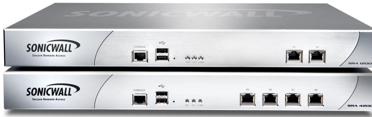
SRA Series (SMB SSL-VPN)

12 reasons why you should now upgrade to the new SonicWALL SRA SSL-VPN generation!