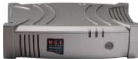
2U only in rack.

Protection for 1 to 4 workstations or small servers