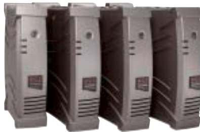
From 600 to 1500 VA.