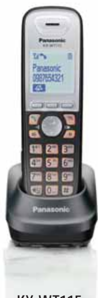
KX-WT115 Entry Level Model