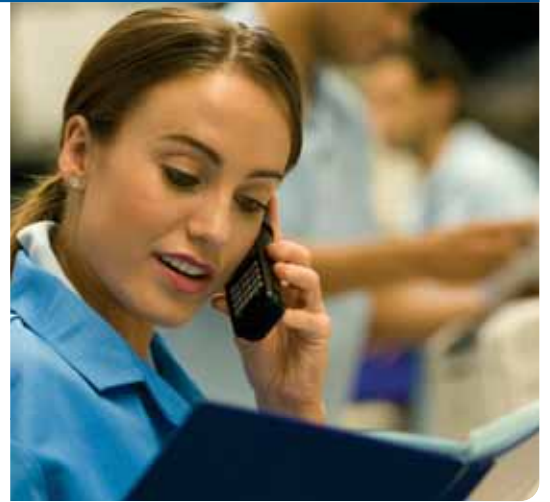
BUSINESS DECT BROCHURE