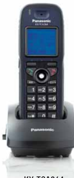
KX-TCA364 Tough Type Model