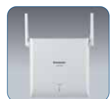
KX-NCP0158 8ch IP Cell Station