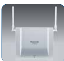
KX-TDA0155 2ch Cell Station