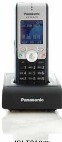
KX-TCA275 Compact Business Model