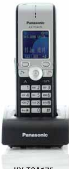
KX-TCA175 Standard Model