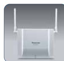
KX-TDA0158 8ch Cell Station