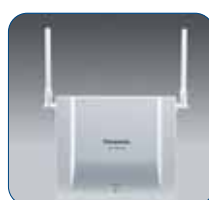
KX-TDA0156 4ch Cell Station